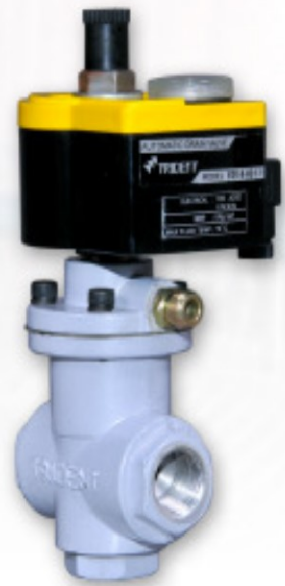
EDV X HD11