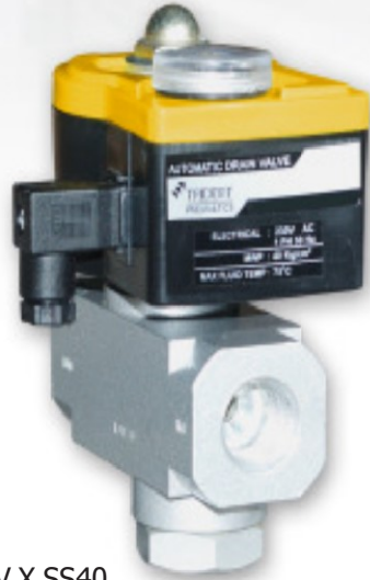
EDV X SS40